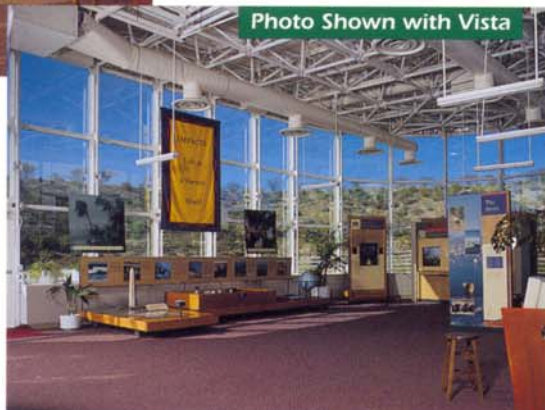
Photo Shown with Vista